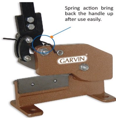
PLATE BENCH SHEAR - SPRING TYPE