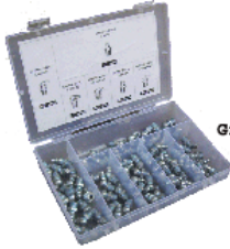
Grease Fitting Set